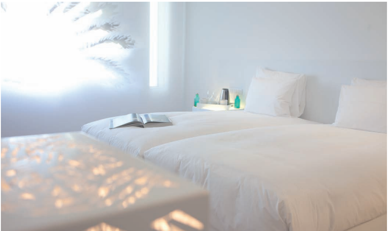
Renaissance Barcelona Fira Hotel, Spain