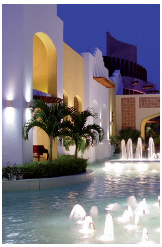
Iberostar hotel, Mexico